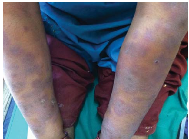
Figure 3. Clinical photograph of patient of erythema nodosum (Patient 22, Study group)