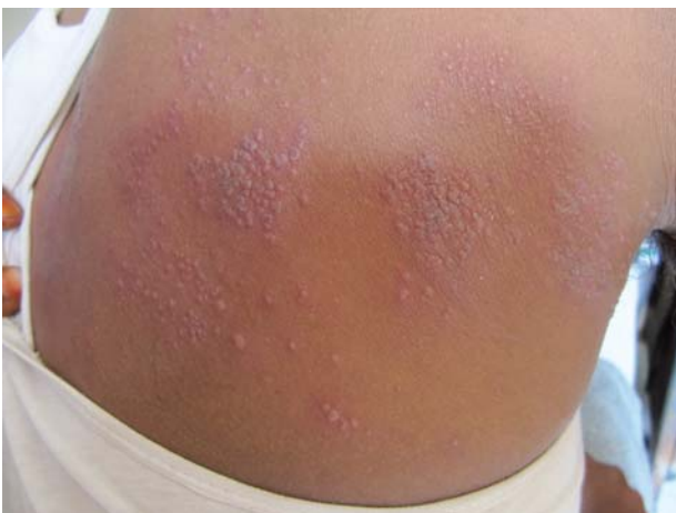
Figure 1. Clinical photograph of patient of herpes zoster affecting T4 (Patient 12, Study group).

There was a significant difference in the incidence of pityriasis versicolor, herpes zoster (Figure 1), erythema nodosum (Figures 2&3) and borderline lepramatous leprosy (Figure 4) between the study and the control group. There was not much difference in the incidence of other conditions, like scabies, acniform eruptions, non-specific pruritus and psoriasis. In fact, acniform eruptions and non-specific pruritus was more common in the control group rather than in the study group.