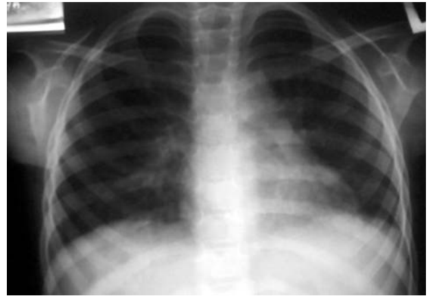
Figure 3. Repeat chest radiograph (postero-anterior view) after COP reduction showing resolution of miliary infiltrates. COP=Cyclophosphamide, vincristine, prednisolone

After four cycles of chemotherapy (COP, COPADM1, (Cyclophosphamide, Vincristine [oncovin], Prednisolone, Doxorubicin [Adriamycin], Methotrexate) COPADM2, and CYM1(Cytarabine, Methotrexate), she showed a good response without any active lesions. She has completed CYM2 and thereby a total of five cycles as per group B based therapy of LMB 96 Protocol. A repeat chest radiograph after completion of therapy was normal. She is currently under follow-up for last six months and is doing well.