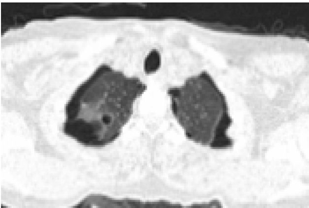
Figure 5. HRCT chest showing bilateral residual pneumothorax.

Later pleurodesis was done first on the right side and next on the left side through tube thoracostomy and intercostal tubes were removed on the next day. Even after pleurodesis, patient complained of right pleuritic chest pain. Repeat chest radiograph (postero-anterior view) showed right-sided partial pneumothorax with pleural thickening (Figure 6) and she was again managed with ICD tube insertion.