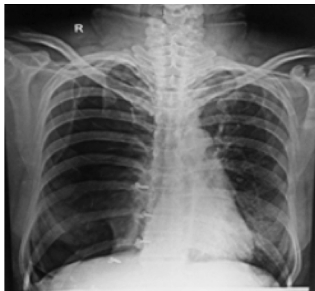
Figure 1. Chest radiograph (postero-anterior view) taken with abdominal shield obtained during the first episode showing right-sided pneumothorax.

A 30-year-old female, gravid 2, para 2, live birth 1, abortion 0 (G2P2L1A0) at 36 weeks of gestational age presented with sudden onset of breathlessness, cough with expectoration since two days. There was no history of fever, chest pain, haemoptysis. She was a non-smoker. Her body mass index (BMI) was 21.2 Kg/m 2 . There was no history of previous pulmonary disease. Antenatal ultrasonography was normal with adequate liquor. Routine antenatal investigations were normal except for the chest radiograph (postero-anterior view) which showed a right-sided pneumothorax (Figure 1). She was managed with intercostal tube (ICD tube) drainage underwater-seal and the pneumothorax resolved completely in a few