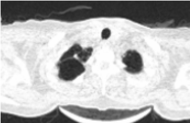
Figure 4. HRCT chest showing emphysematous changes in upper lobes.