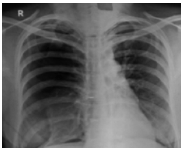
Figure 2. Chest radiograph (postero-anterior view) taken with abdominal shield obtained during the second episode showing right-sided pneumothorax.

days. At 40 weeks of gestational age she was re-admitted with similar symptoms. Repeat chest radiograph (postero-anterior view) showed recurrence of right-sided pneumothorax (Figure 2). She again underwent tube thoracostomy. After two days of treatment she complained sudden onset of left sided pleuritic chest pain. On examination, she was tachypnoeic; auscultation showed diminished breath sounds on the left side. Chest radiograph (postero-