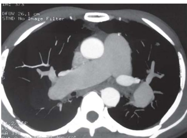
Figure 3. Contrast-enhanced computed tomography of thorax (axial view) showing grossly dilated pulmonary trunk and arteries as comparison to other mediastinal structures which suggestive of pulmonary hypertension.

dilated right atrium and right ventricle, mild tricuspid regurgitation, mean pulmonary arterial systolic pressure of 52mmHg and an ejection fraction of 60%, suggestive of pulmonary hypertension, cor-pulmonale. Further evaluation of pulmonary hypertension by right heart catheterisation was planned but was refused by the patient. A diagnosis of Ortner's syndrome due to entrapment of recurrent laryngeal nerve between enlarged pulmonary arteries and distorted bronchovascular structures was made.