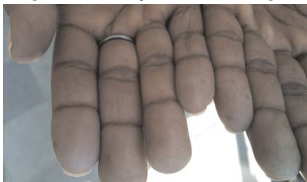
Figure 1. Photograph showing Raynaud's phenomenon on exposure to cold water (arrows).

A 28-year-old male came to our out-patient department with complaints of progressive dyspnoea on exertion since last six months and cough with minimal expectoration since five months. He also gave a four-year history of bluish discolouration of fingers during winters and on exposure to cold water (Figure 1).